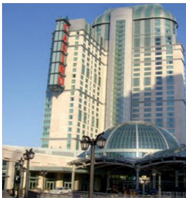
Niagara Fallsview Casino Resort With 8" Profimat A/TP